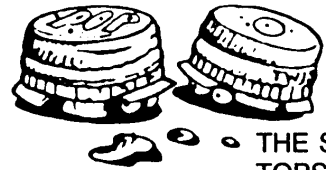
THE SODA POP TOPS ...The bottom of the barrel.