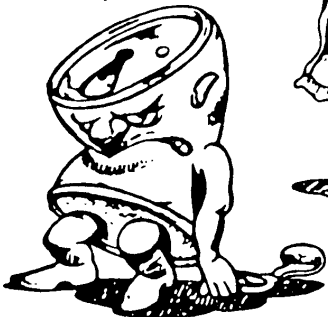
TIN CAN O'MALLY ...he's always bent out of shape