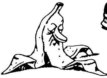
SLIPPERY SAM, THE BANANA MAN Watch out! He'll trip you up!