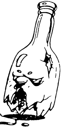
"BUGSY" BROKENBOTTLE Desperate & dangerous... he'll cut you to the quick!